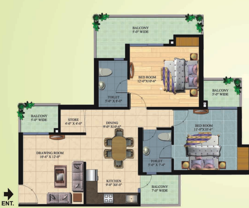
Tower-O Unit Plan Super Area= 1240 Sq.ft. 2 Bedroom+Dining+2 Toilet+Store