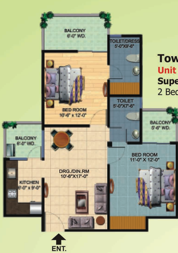
Tower-B1 Unit Plan Super Area= 1060 Sq.ft. 2 Bedroom+2 Toilet+Dress