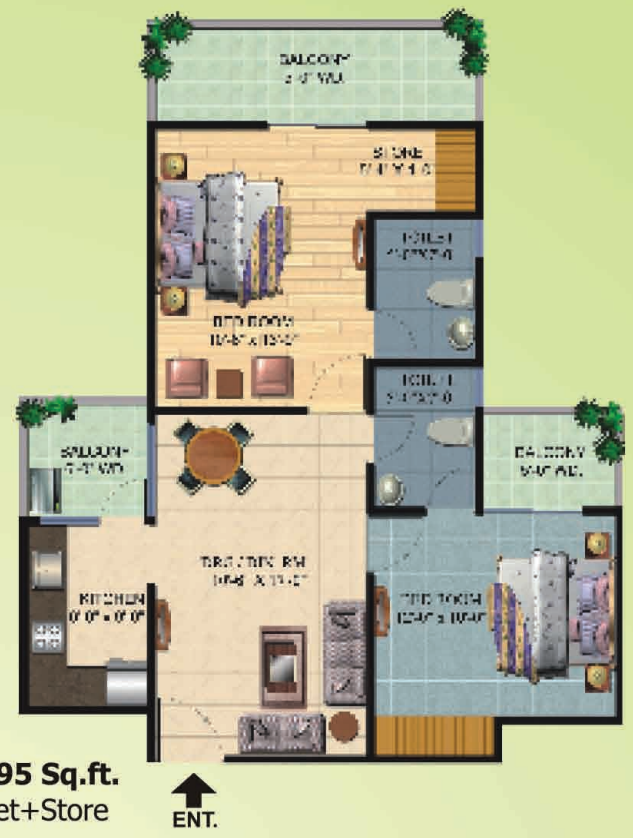
Tower-B1 Unit Plan Super Area= 1095 Sq.ft. 2 Bedroom+2 Toilet+Store