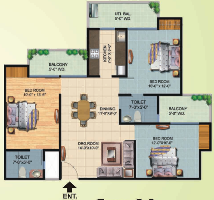
Tower-G, I Unit Plan Super Area= 1290 Sq.ft. 3 Bedroom+Drawing/Dining+ 2 Toilet+Kitchen+Balcony