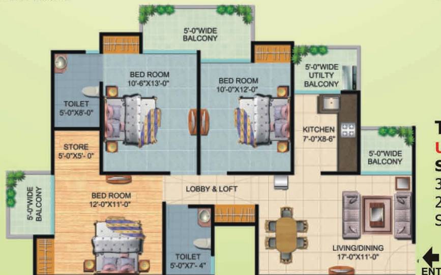
Tower-J Unit Plan Super Area= 1330 Sq.ft. 3 Bedroom+Drawing/Dining+ 2 Toilet+Kitchen+ Store+Balcony