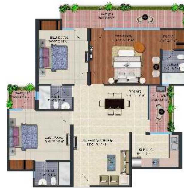
Area- 1660 Sq. Ft. 3 Bedroom, Dressing Room. 3 Toilet. Kitchen. Dining. Drawing. 3 Balconies.