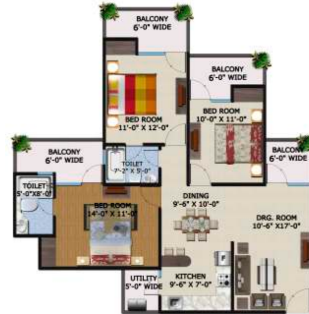
Area- 1545 Sq. Ft. 3 Bedroom. 2 Toilet. Kitchen. Dining. Drawing. 4 Balconies.