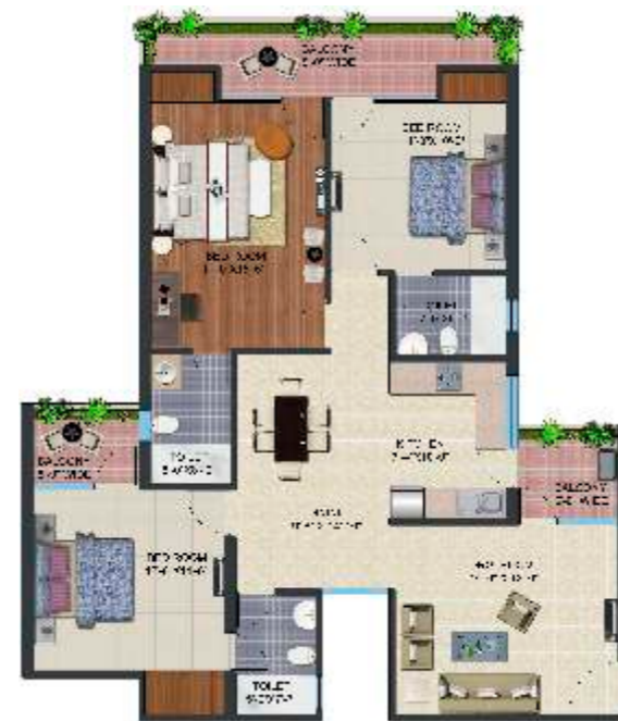
Area- 1660 Sq. Ft. 3 Bedroom, Dressing Room. 3 Toilet. Kitchen. Dining Drawing. 3 Balconies.